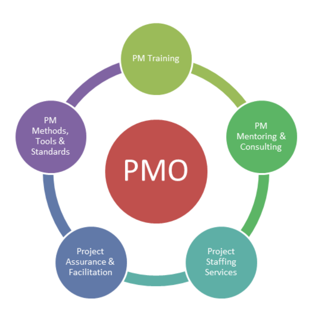
Figure 1: Project Management Services Model