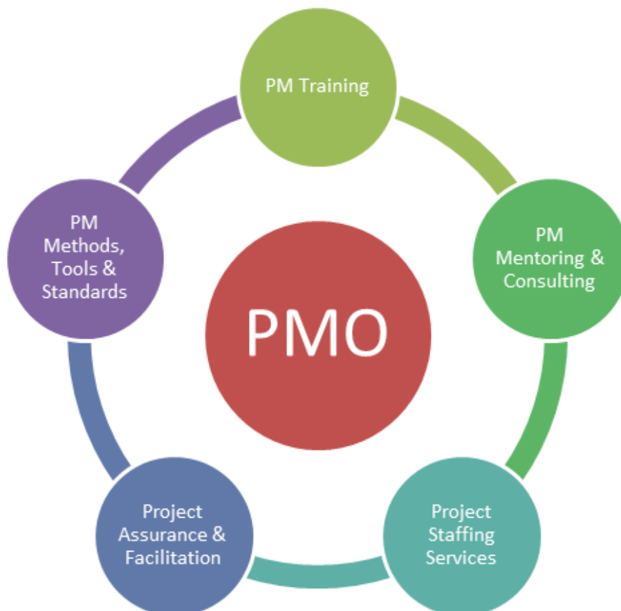
Figure 1: Project Management Services Model